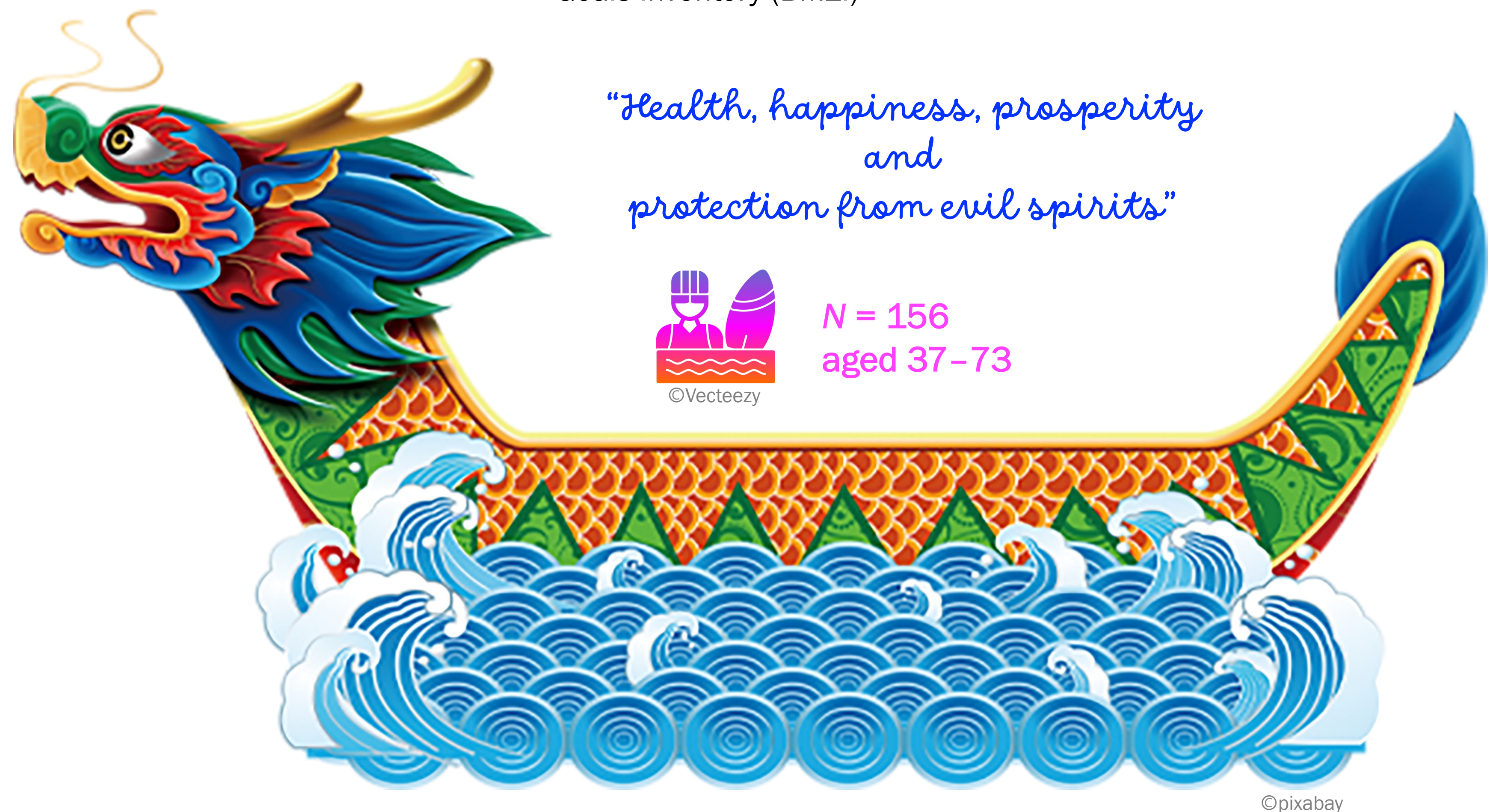
Quality of live meets motivation

The present study addresses the extent to which health status may affect motives to participate in dragon boat sports in the presence of breast cancer, and to test the hypothesis whether lower health-related quality of life (QOL) leads to stronger expression of motives.